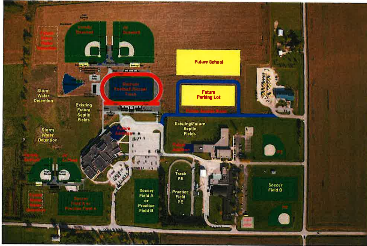
① Overall Site Plan (Site Concept C1) 1" = 300'-0"