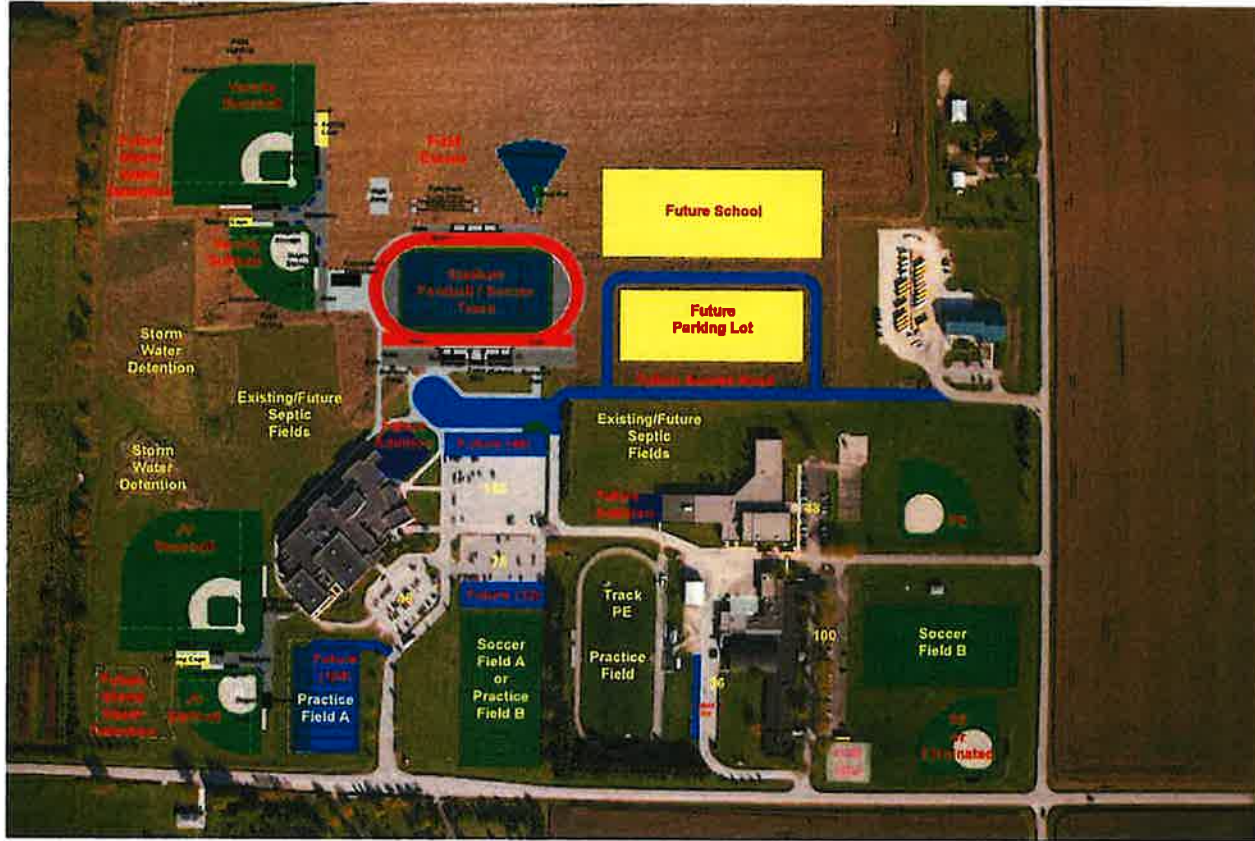
① Overall Site Plan (Site Concept C2.2) 1" = 300'-0"