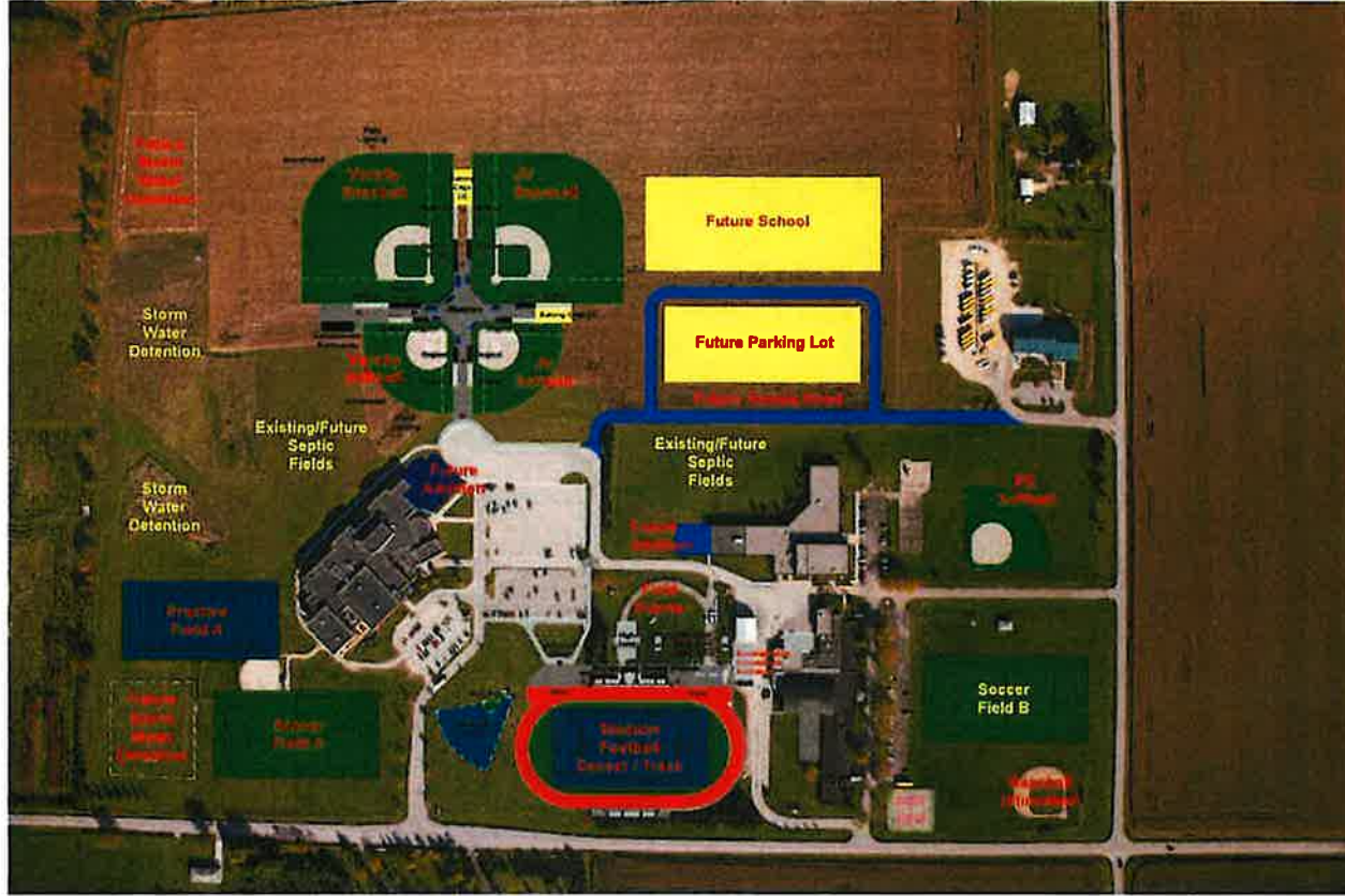
1 Overall Site Plan (Site Concept B1) 1" = 300'-0"