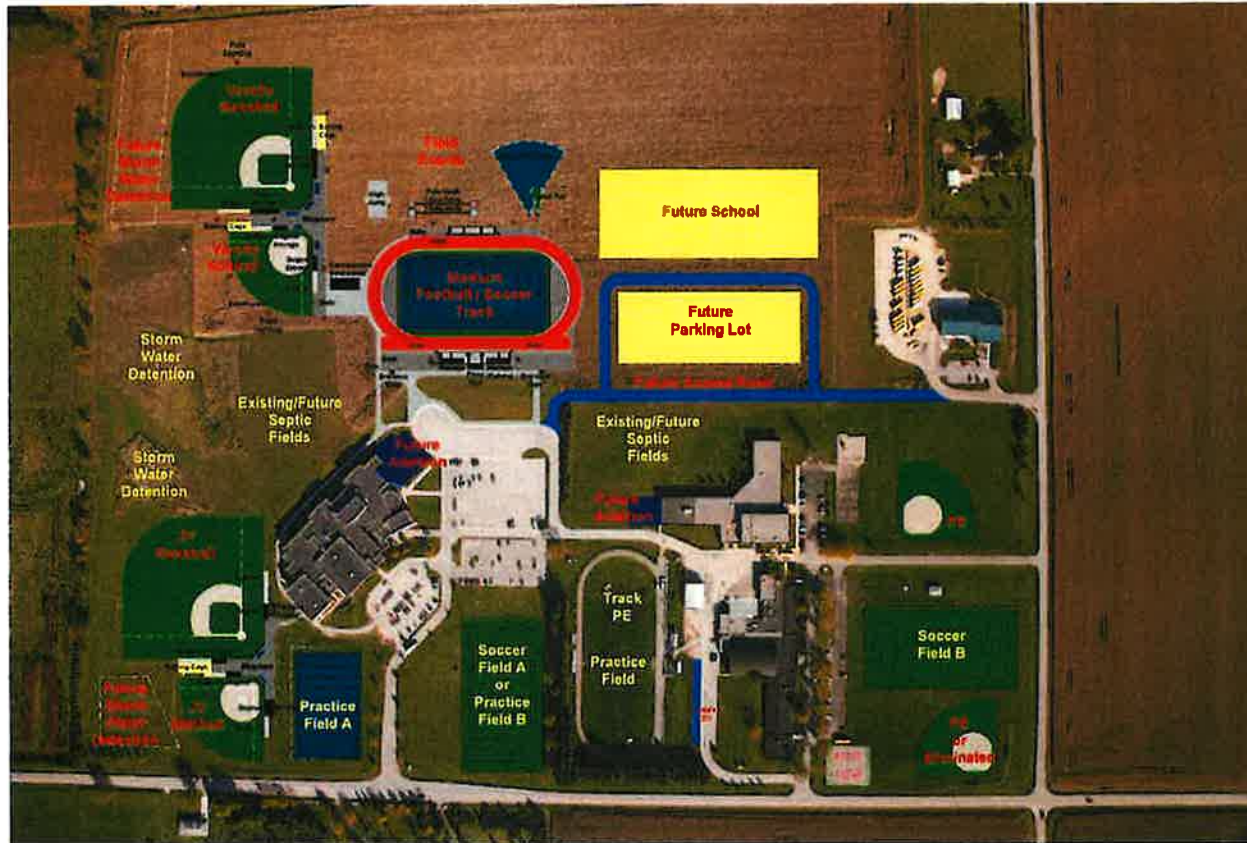
① Overall Site Plan (Site Concept C2.1) 1" = 300'-0"