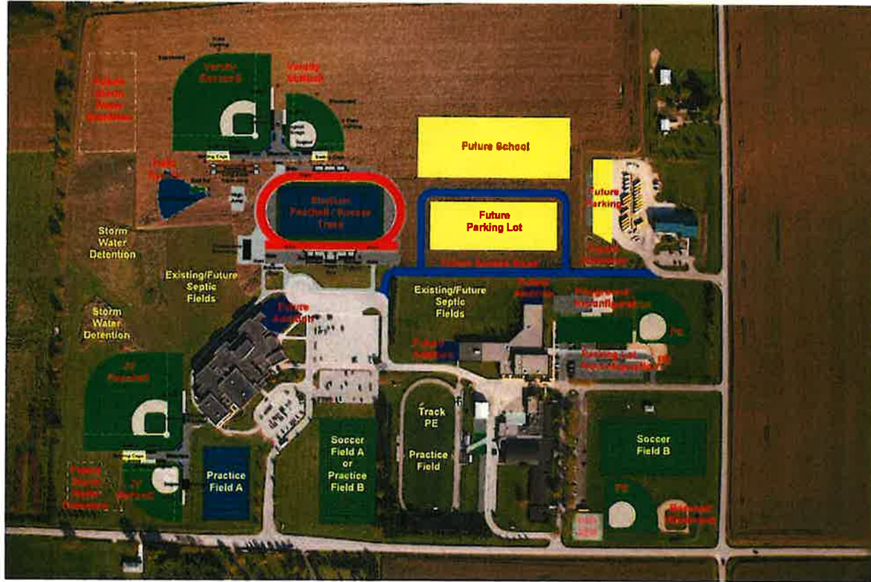
① Overall Site Plan (Site Concept C2b) 1" = 300'-0"