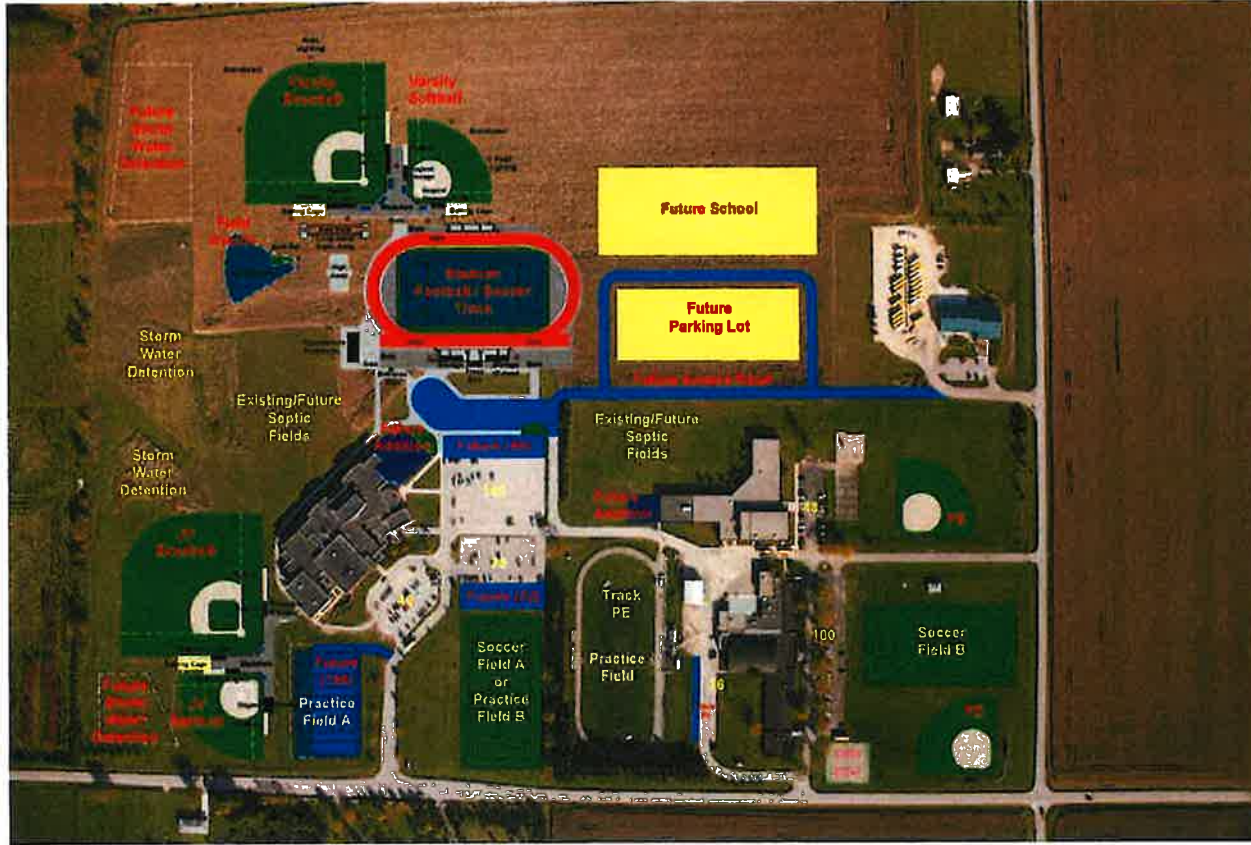
① Overall Site Plan (Site Concept C2a) 1" = 300'-0"