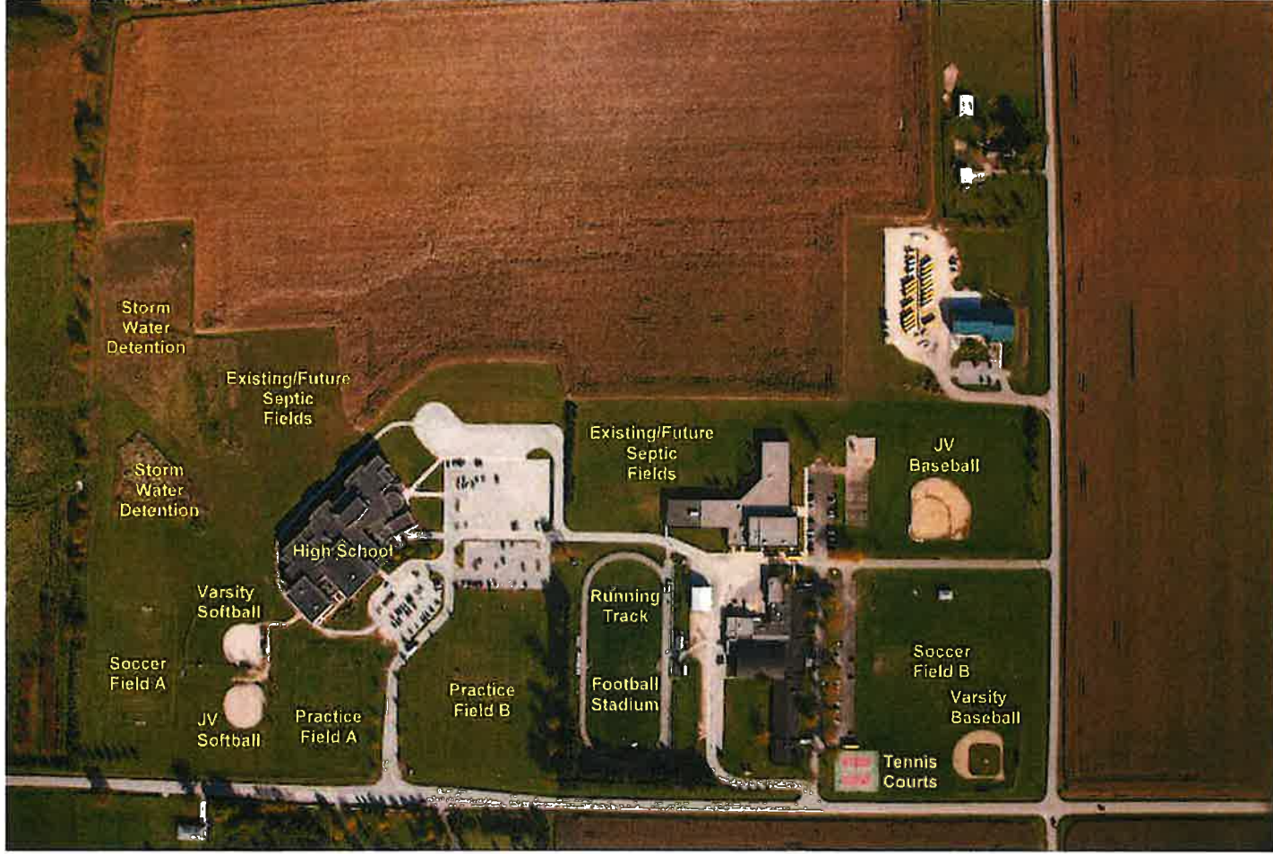
① Overall Site Plan (Existing) 1" = 300'-0"