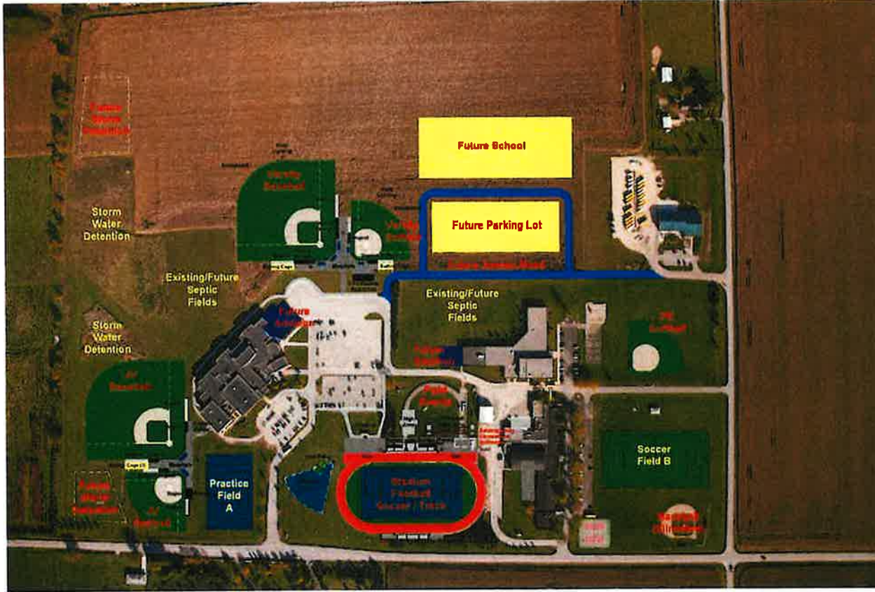
① Overall Site Plan (Site Concept B2) 1" = 300'-0"