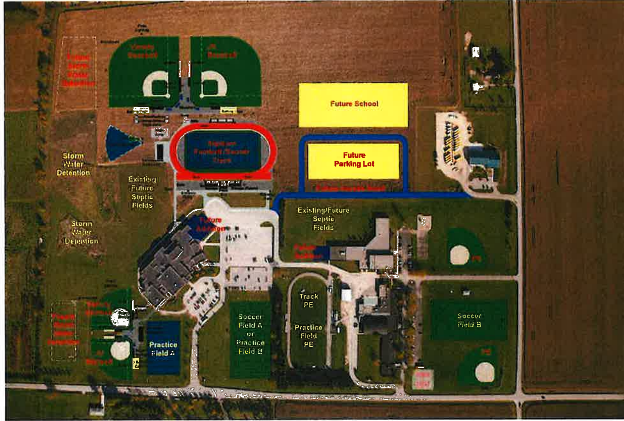
① Overall Site Plan (Site Concept C1a) 1" = 300'-0"