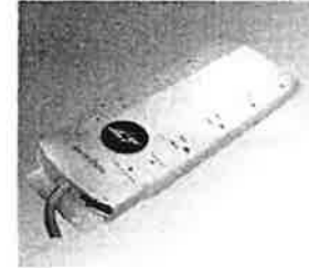
TOWERMAX SURGE PROTECTOR - $85