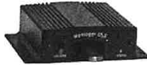
ON-HOLD MESSAGER - $450