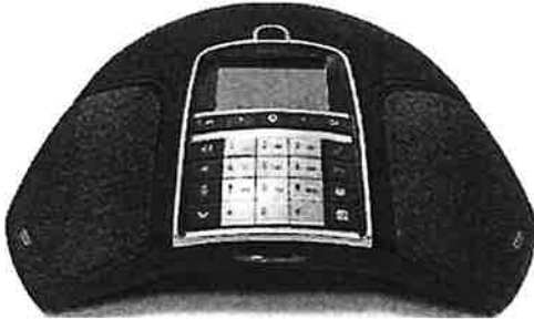
AVAYA B179 SIP CONFERENCE ROOM PHONE -$1,090