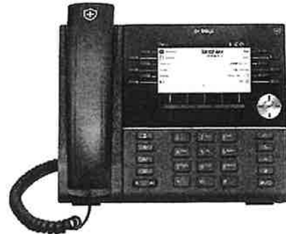
Image of UJe 6930Lt IP Phones

The phones features a redesigned handset that minimizes crevices and holes that might collect germs, dirt, and grime. The handset's smooth surfaces and hard-wired cord make for easy cleaning, facilitating a more hygienic device.